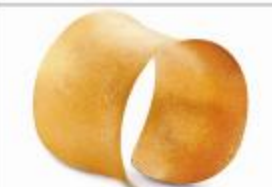
Golf cuff from carallane.com, ₹94,450