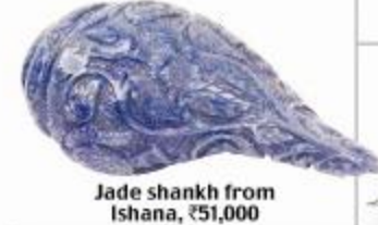
Jade shankh from Ishana, ₹51,000