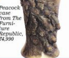
Peacock vase from The Furniture Republic, ₹4,990