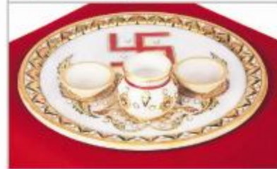
Swastika marble thali from Moha, ₹3,168