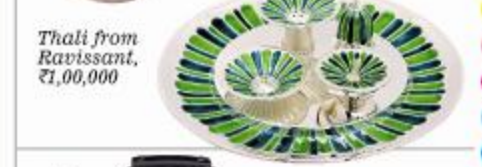
Thali from Ravissant, ₹1,00,000