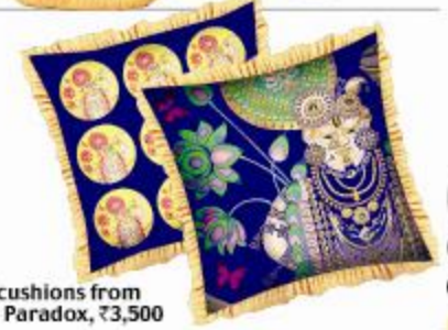
Pop cushions from Casa Paradox, ₹3,500