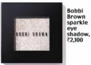
Bobbi Brown sparkle eye shadow, ₹2,100