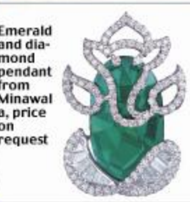
Emerald and diamond pendant from Minawala, price on request