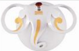
Ganesha showpiece from Frazer and Haws, ₹13,100