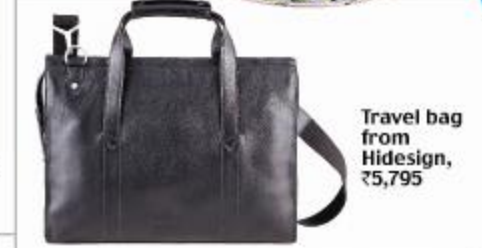
Travel bag from Hidesign, ₹5,795