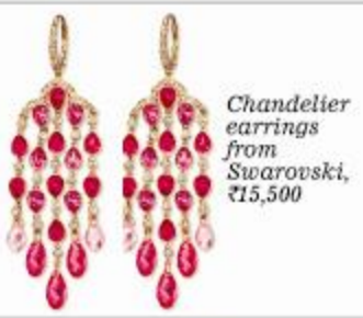
Chandelier earrings from Swarovski, ₹15,500