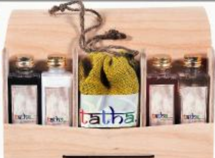
Calming collection from Tatha, ₹1,500