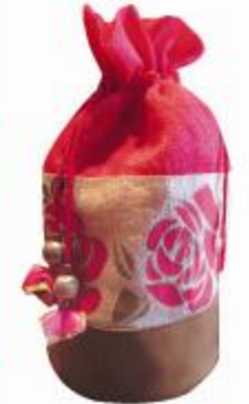
Festive potli from Madsam Tinzin ₹2,500