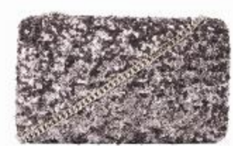
Sequin clutch from koovs.com, ₹2,195