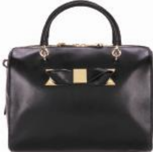
Ted Baker top handle bag available at The Collective, ₹18,000