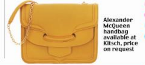
Alexander McQueen handbag available at Kitsch, price on request