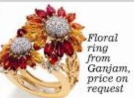
Floral ring from Ganjam, price on request