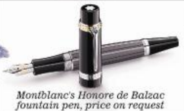
Montblanc's Honore de Balzac fountain pen, price on request