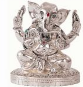
Silver Ganesha showpiece from Ekaani, price on request