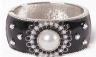
Chunky pearl bracelet from Kazo, ₹890