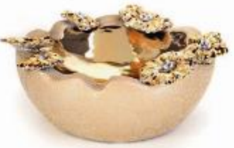
Floral ash tray from fabfurnish.com, ₹350