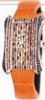
Carl F. Bucherer timepiece available at Ethos Summit, price on request