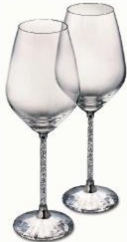
Crystallised wine glasses from Swarovski Elements, price on request