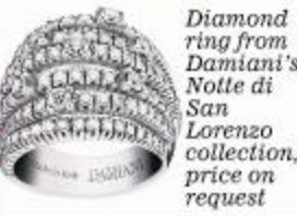
Diamond ring from Damiani's Notte di San Lorenzo collection, price on request