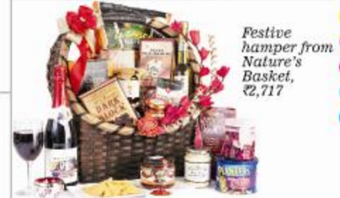
Festive hamper from Nature's Basket, ₹2,717