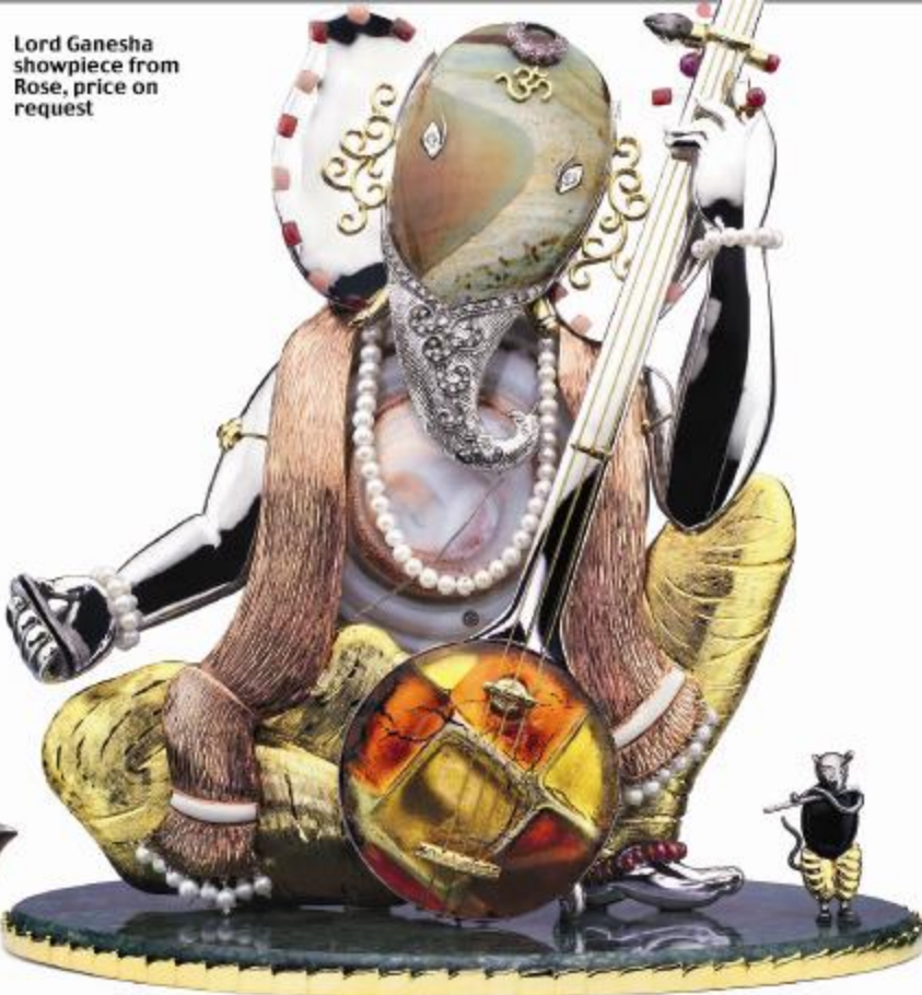
Lord Ganesha showpiece from Rose, price on request