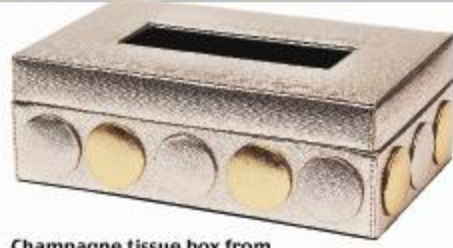
Champagne tissue box from Address Home, ₹1,500