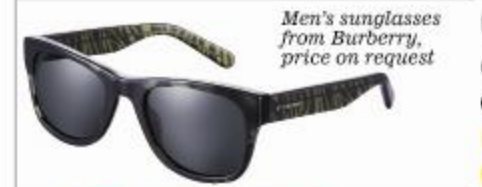
Men's sunglasses from Burberry, price on request