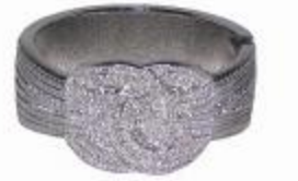
Studded cuff from Global Desi, ₹799