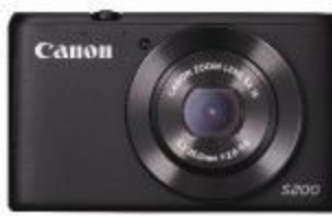
Canon Powershot S200, ₹19,995