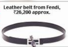
Leather belt from Fendi, ₹26,200 approx.