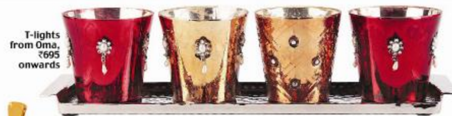
T-lights from Oma, ₹695 onwards