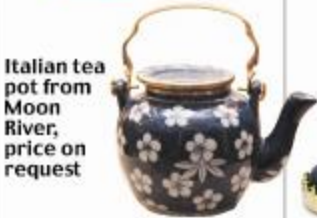
Italian tea pot from Moon River, price on request