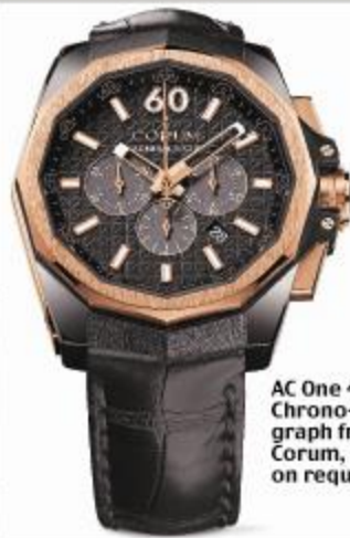
AC One 45 Chronograph from Corum, price on request