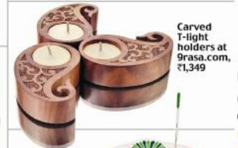
Carved T-light holders at 9rasa.com, ₹1,349