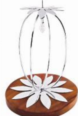
Candle stand from velvetcase.com, ₹9,250